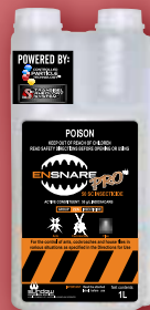
EnsnarePRO 50 SC non-repellent residual insecticide