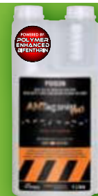
ANtagonistPRO Polymer Enhanced residual insecticide