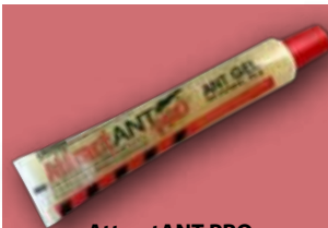
AttractANT PRO Ant Bait Gel