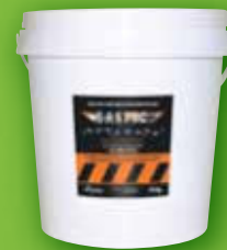
SAS PRO Fipronil non-repellent granular ant treatment